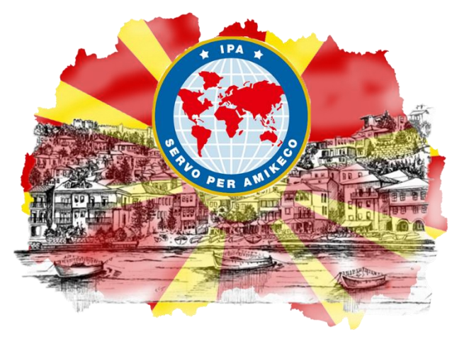
Dear IPA members, friends...

We invite you to enjoy together in the beauties of our country, to make friends and have fun during the week of friendship in the period from September 22<sup>nd</sup> till 29<sup>th</sup>, 2024. North Macedonia is a country with great opportunities, country with beautiful mountains, forests, lakes and rivers, located in the center of the Balkan Peninsula, it has been a peaceful place for decades. In addition to the beautiful natural treasures, including quality limestone rocks, you will find a special glimpse of culture and history. If you have an adventurous spirit and you are looking for a vacation