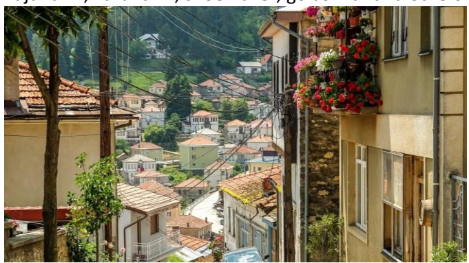
All of them work as coopers, coppersmiths, coppersmiths, bakers, carpenters, etc.

of the former Krushevo Republic (1903). At 1,350 meters above sea level, Krushevo is the only mountain town in North Macedonia and the highest town on the Balkans. Above the city is the famous monument Makedonium. In the center of the city, the neighborhood alleys, steep and narrow, bend, break and climb, following the terrain and the unwritten rules of the old urban agglomerations. The bazaar is made up of a series of small craft and commercial shops, lined up next to each other. It is the most picturesque part of the city, to which the neighborhoods continue, where the whole life takes place. Some of the old trades still exist from the once widely known Krushevo bazaar: tinsmith, kujundzhi, kazandzhi, shoemaker, goldsmith and others.