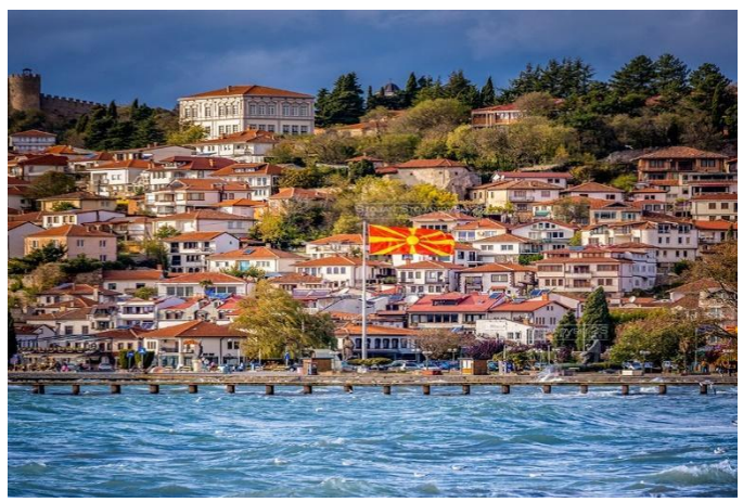
which is located in old city the restored church of St. Clement whose findings point to the fact that there was a university there from the 13th century.

was the most important educational center and source of literacy for all Slavic peoples. It houses the oldest university in Europe (IX century), while in Plaoshnik