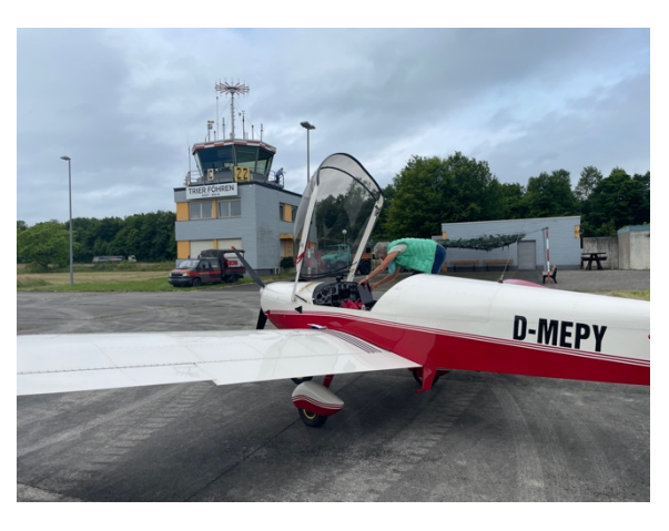
Flying Club e.V..