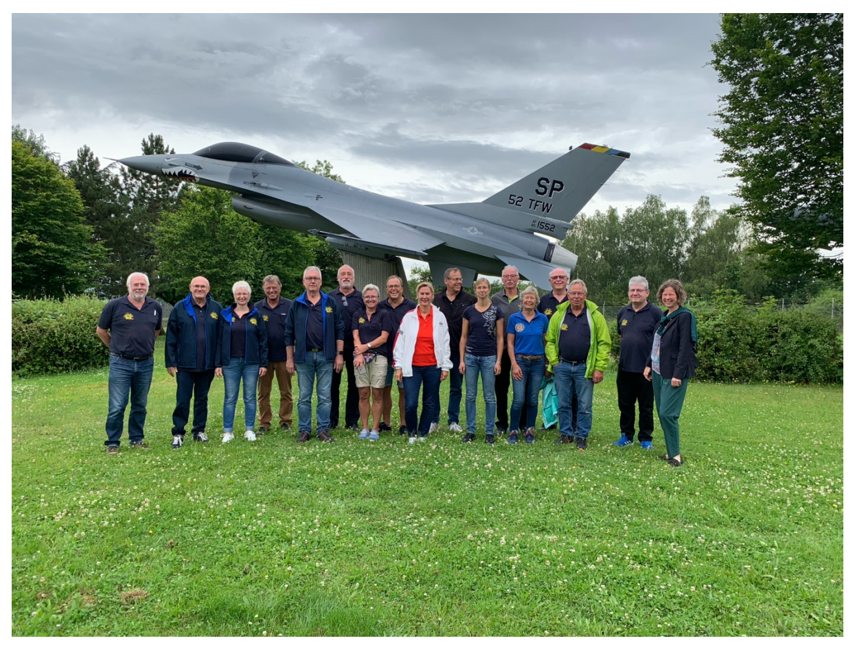
Group photo of the participants – on the far right, the head of the visitor center